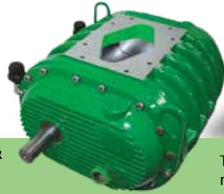
510 SRT BLOWER

The 3510 AGRI-VAC , The 3510 machine moves almost all agricultural products on a cushion of air, maintaining grain and especially seed quality. It provides versatility for any operation because of its portability. It can be maneuvered into the tightest corners, it transfers product easily, so cleaning up or loading